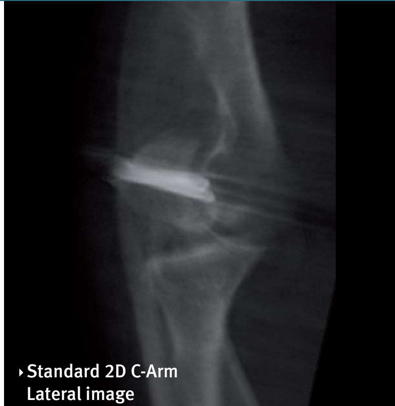
▶ Standard 2D C-Arm Lateral image